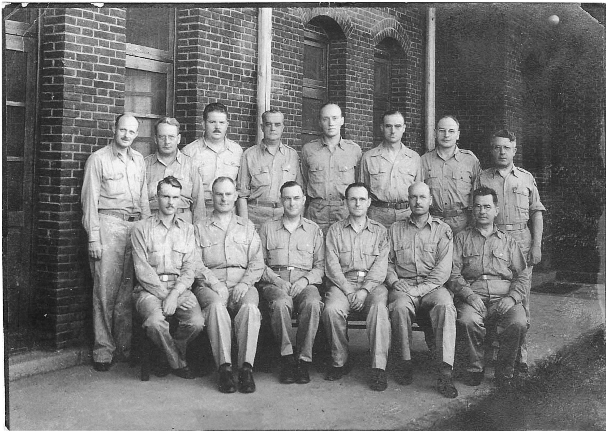
PAGE DOWN FOR IDENTIFICATION OF KNOWN LIAISON OFFICERS